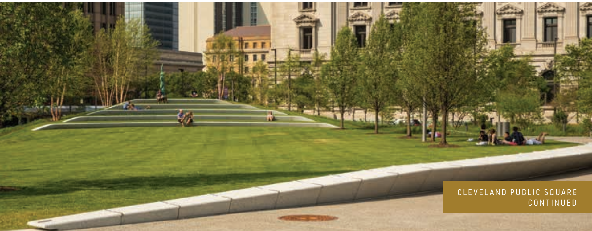
CLEVELAND PUBLIC SQUARE CONTINUED